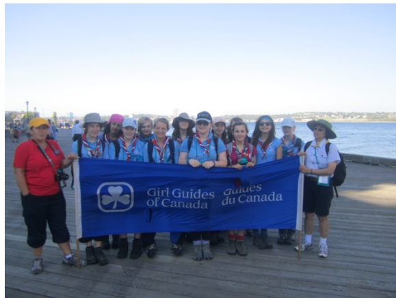
Us: The Bucks Guides after finishing the amazing race