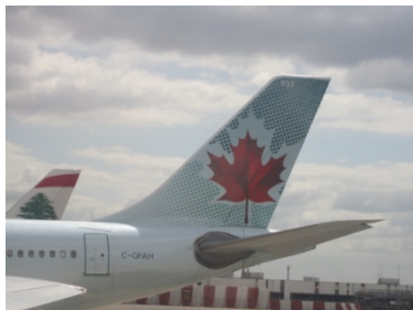
← Our plane, The food →

In the early morning of the 9 th of August 2011, I had to get up bright and early, around 6am, to get ready for the journey to Heathrow airport to meet up with the other 11 girls and 3 leaders. I arrived at the airport at about 8:30am, and we were to board our plane, Air Canada, at 12:30pm. But it was a bit nerve-wracking when going through security and customs, because you feel so innocent but there's that feeling that you may have done something wrong! Thankfully, everything was all right, and we were on the plane in no time. I watched loads of films on the plane, as I didn't want to sleep, although the leaders were asleep in no time! The food was really nice on the plane too, which was a change! The flight lasted around 7 hours.