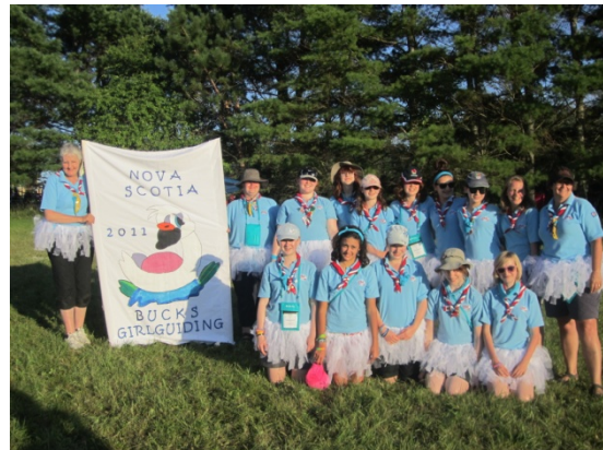
Us: The Bucks Guide swans