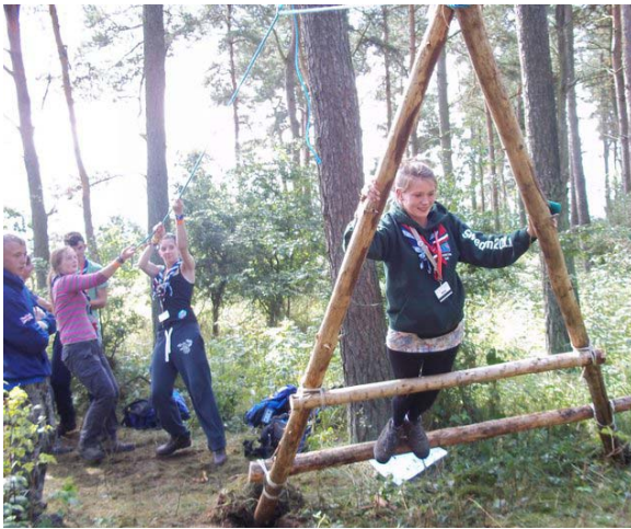
Team building activity